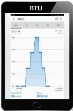
Heat Energy Capacity in BTU/Hr