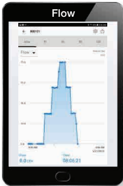
Flow readings in Cubic Feet per Hour (CFH)